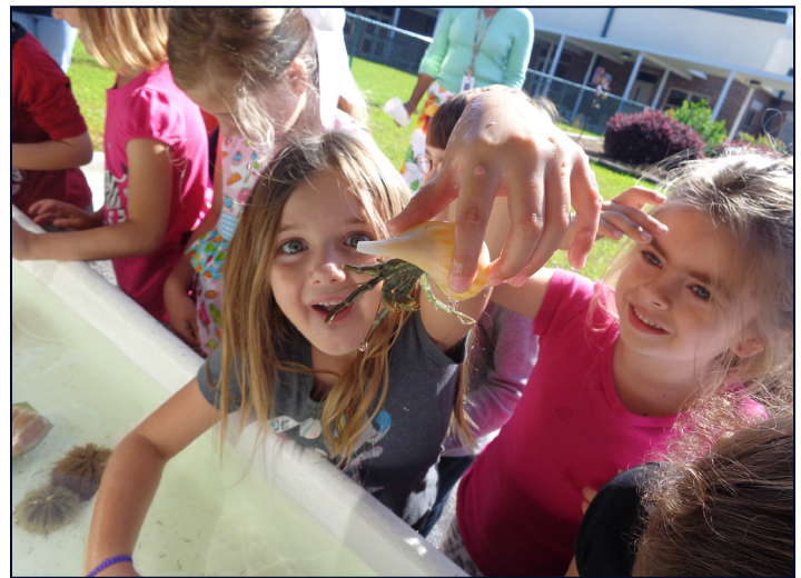
MOBILE AQUARIUM VISITS HAND-IN-HAND - All Hand-In-Hand's kindergartners loved exploring the touch tank in the Gulf Specimen Marine Lab Sea Mobile marine life educational traveling exhibit. The five touch tanks included starfish, sea urchins, conchs, crabs, sponges and a variety of other interesting and colorful sea life. A scientist taught everyone about common animals in the Gulf of Mexico, and about the fragile ecosystem there.

interpretation, leadership and social skills.