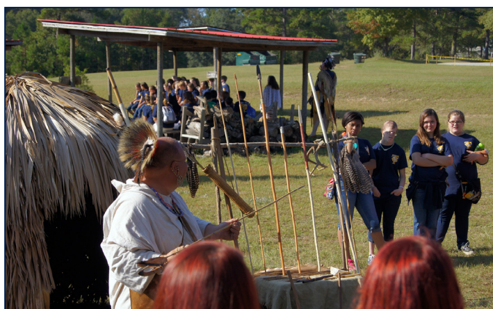
TCMS STUDENTS ATTEND SCHOOL DAYS EVENT – The 8th grade MERIT team at Thomas County Middle School, Zulu Company, recently attended the annual Lower Muskogee Creek Tribe's 2013 School Days and Pow-Wow in Whigham, Georgia. The students learned about the history and culture of the Muskogee Creek people. Students learned about the importance of storytelling, the skill of hunting, and the art of Native dancing.