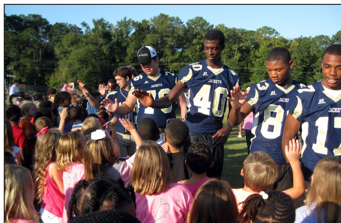
Band members, cheerleaders, and athletes from TCCHS were at Garrison Pilcher for the recent reading rally.