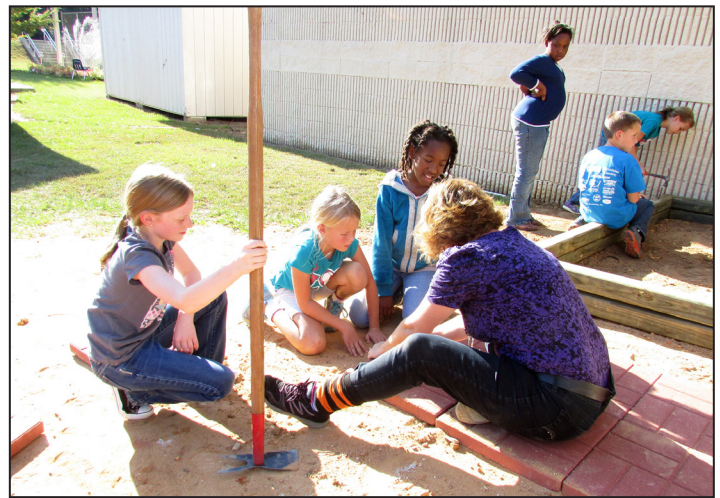
“LEARNING THROUGH GROWING PROJECT” - Cross Creek K-kids were awarded the “Lowes Grant” for the 2013 – 2014 school year. The club was awarded grant money in the amount of $4,800 to construct an outdoor classroom. The outdoor classroom is beginning to take shape. Recently, a concrete pad was poured to serve as the classroom area. Cross Creek is now in the process of constructing raised flower beds and purchasing equipment to complete the gardening areas. Project completion is scheduled for November 9, 2013. Along with the Lowes Grant, Cross Creek received grant money and donations from Thomasville Wal-Mart to help with costs of flowers and plants. They are so excited about the progress and want to thank Bee Partners, Wal-Mart and Lowes, for making this project a reality for their students. Pictured are Loxley Slocumb, from left, Kendall Alligood, and Brooklyn Cohen with teacher Laura Daughtry leveling new pavers.

CLCP promotes literacy in Georgia by involving the whole community. By making literacy a community-wide commitment, a diversity of key resources are mobilized to promote and support literacy training.